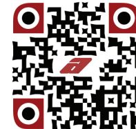
IBC Code Enforcement By State: Current Year of Code (As of March 2018)

If your location is YELLOW , RED , TEAL or PURPLE , a Two-Way Emergency Communication System is required in all new or "change-of-use" multi-story buildings!!