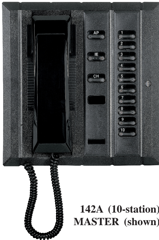
142A (10-station) MASTER (shown)